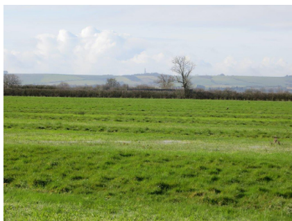
Downs view from Grove Cemetery

You may notice the undulations in the field to your left which mark the old pattern of farming. The road takes a sharp right bend to go over the railway via a narrow high bridge, and you carry on for a further half mile to the village of Denchworth with its picturesque thatched cottages. Arriving at a T-junction in Denchworth the route turns right signed towards West Hanney. (This point is known as Denchworth Cross, from the existence of an old stone