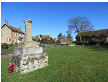
The Chequers, Charney Bassett

6 Follow the road for about half a mile to the village of Charney Bassett. The village pub, The Chequers, which you pass on your right, makes a good point to take a break.