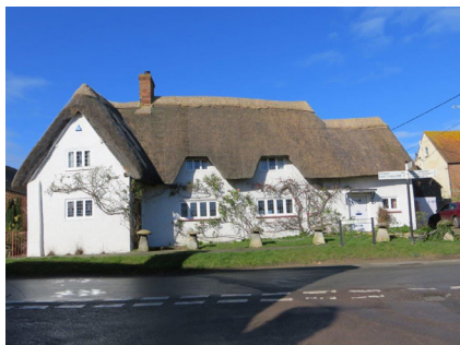
Thatched Cottage, Denchworth Cross

You may notice the undulations in the field to your left which mark the old pattern of farming. The road takes a sharp right bend to go over the railway via a narrow high bridge, and you carry on for a further half mile to the village of Denchworth with its picturesque thatched cottages. Arriving at a T-junction in Denchworth the route turns right signed towards West Hanney. (This point is known as Denchworth Cross, from the existence of an old stone