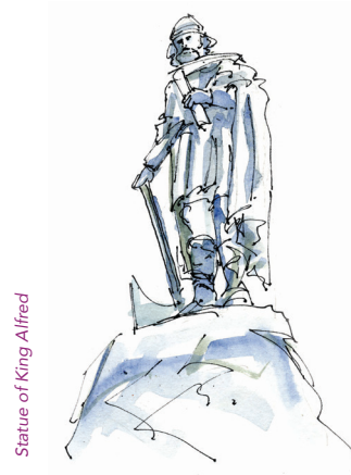
Statue of King Alfred

You will now retrace your route back to Wantage as follows: From here take the cycle route (effectively a right turn) towards Wantage. Stay on the cycle track until it ends at traffic lights. Carry straight on, after a few hundred yards the road rises to the "Sainsbury's" roundabout, go straight on, and carry on along Seesen Way to the next roundabout with the BP "Broadway" garage opposite. Turn right to return to Wantage Market Square.