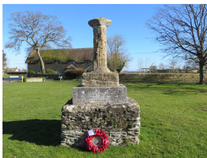
Charney Bassett Green, Memorial

towards Challow Station and Denchworth. There is a turning to the left just before the bridge where one of the shorter options re-joins the main route. Stay on the road for a further mile until you arrive at a T-junction. (The road angled to the left is a point where one of the shorter options joins, and can itself provide a shorter route back to Grove and Wantage. See map).