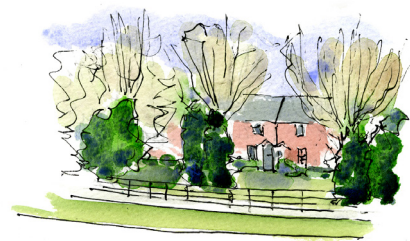
Grove Road cottages

7 On arriving in Grove turn left at the T-junction then, to vary the route through Grove, turn right at the mini roundabout into Brereton Drive and follow this for about half a mile until it turns sharp right, at which point turn left into Cane Lane. Follow Cane Lane, which has a barrier to stop cars part way along, to its end, a T-junction with Main Street in Grove, with the garage on your right. Turn right onto Main Street to reach the traffic lights at the end of Grove.