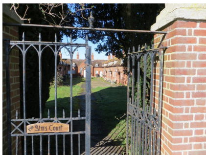
Almshouses at Lyford Village

4 Leaving Denchworth Village by a double bend in the road carry on along the lane. The first turning left (after about half a mile) provides a shortcut to the later stages of this route for those wanting a shorter cycle ride (see map). Staying with our route however, about 400 yards further on take the next lane left signposted to Lyford. After about \frac{3}{4} mile the lane makes a sharp left bend, followed soon afterwards by another to the right in Lyford Village. After